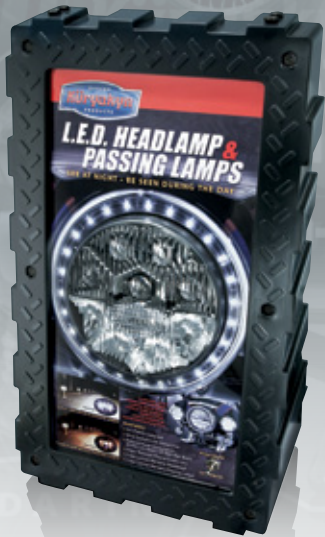
L.E.D. HEADLAMP P/N 112537