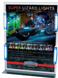
SUPER LIZARD® LIGHTS P/N 112500