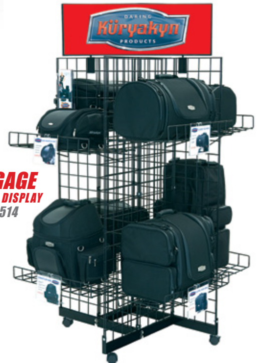
LUGGAGE ROLLING DISPLAY P/N 112514