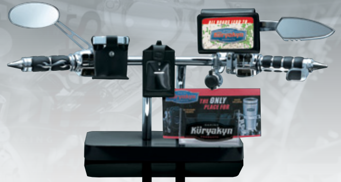
HANDLEBAR ACCESSORIES P/N 112523