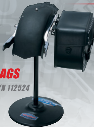
EDGE SADDLEBAGS & BRACKETS P/N 112524